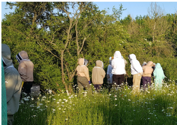
Students getting hands-on with the bees on a sunny evening in June 2021.