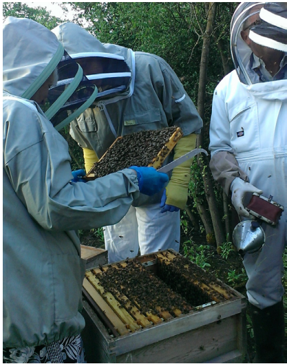
Students getting hands-on with the bees at a practical session in 2016.